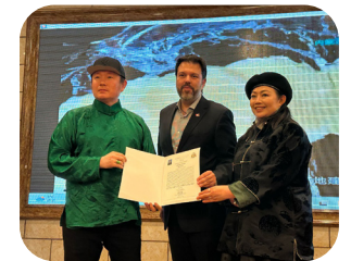
At the Inner Mongolia Association Canada Closing Ceremony | 出席加拿大内蒙古协会闭幕仪式

下表概述了第22区2025年的建设工程计划。这些基建项目经过精心协调，力求以最快速、最安全、最高效的方式完成尽可能多的工作，最大限度地减少对居民和通勤者的干扰。我们将持续监控工程进度，并根据天气、场地条件和其他不可预见的因素进行调整。