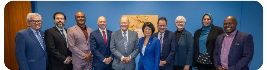
The Mayor, City Councillors and His Highness, the late Aga Khan | 市长、市议员们和已故的阿加汗殿下

这项安全功能使行人在车辆获得绿灯之前优先通过马路，从而提高能见度并减少与转弯车辆的冲突。第22区约有67个交叉路口设有这项功能，其中16个于2024年新增，并计划于2025年新增更多有此安全功能的交叉路口。