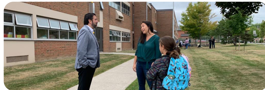
Speaking with parents at Bridlewood Junior Public School on the first day of school | 开学第一天，在布里德伍德公立小学Bridlewood Junior Public School 与家长们交谈

学生营养计划在支持全市儿童和青少年的健康和学习方面发挥着至关重要的作用。截至2025年1月，多伦多市卫生局已提供第22选区学生营养计划实施地点的最新概况。这些计划在学生上课期间提供营养食品，帮助确保学生更好地学习、成长和取得成功。