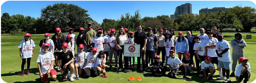
With the Local 416 and young golfers at Tam O'Shanter Golf Course | 与本地 416 俱乐部和年轻高尔夫球手在 Tam O'Shanter 高尔夫球场举办的高尔夫球课程上见面

These plantings will provide long-term environmental benefits, including improved air quality, shade, and habitat for local wildlife—while also creating greener, more welcoming public spaces for residents to enjoy.