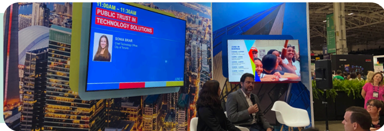
Speaking about tech & innovation at the Collision conference | 在Collision大会上谈论科技与创新

Speed humps were also recently installed on Wishing Well Dr between its north and south connections to Pharmacy Ave to further support safety around schools. Additional locations are being considered in collaboration with City staff and community input.