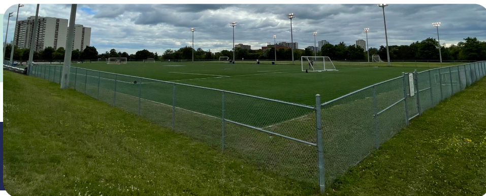
L'Amoreaux Sports Complex | L'Amoreaux体育中心

Tam O'Shanter Golf Course – Minor state-of-good-repair work