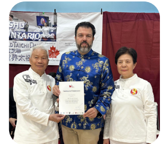
World Tai Chi Day 2025 | 2025年世界太极日