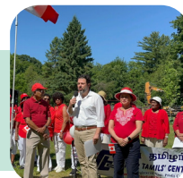
Canada Day 2024 with the Tamil community | 与泰米尔社区一起庆祝2024年的加拿大国庆

在2025年年底之前，311 Toronto仍然为您解决遗漏回收垃圾或维修回收垃圾桶的事宜。了解更多信息，请访问 toronto.ca/epr