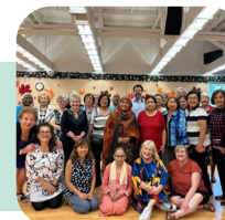
Seniors at the Stephen Leacock Community Centre | 老年人在 Stephen Leacock 社区中心