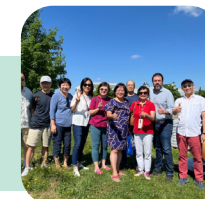
Community Environment Days 2024 | 2024年社区环境日