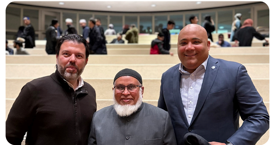
At the 2025 Iftar dinner hosted by City Hall | 出席市政厅举办的 2025 年开年晚宴

鉴于当地居民的强烈关注，随着这项全市战略的逐步成型，我将致力于在第 22 选区寻找新的不拴狗绳区域发展机会。