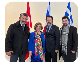
Greek Independence Day Flag Raising | 希腊独立日升旗仪式