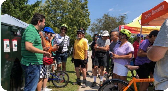
Meeting with Huntingwood Bike Day cyclists | 与亨廷伍德 Huntingwood自 行车日骑行者见面