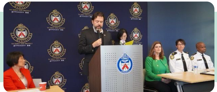
Media announcement for police officer increases at 42nd Division | 向媒体宣布增加第42分局警员人数