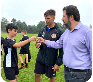
Meeting with youth at L'Amoreaux Sports Complex | 在L'Amoreaux体育中心与青少年见面