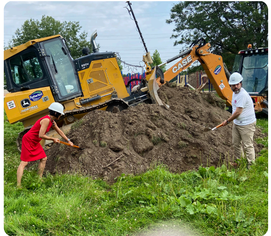
Groundbreaking with Mayor Chow for the Kidstown Water Park | 与周市长一起为儿童水上乐园奠基

住房工作人员定期（包括晚上）到现场与住户见面并解答疑问。社区安全团队也继续在 Agincourt Village 和 Kennedy Commons 之间巡逻。