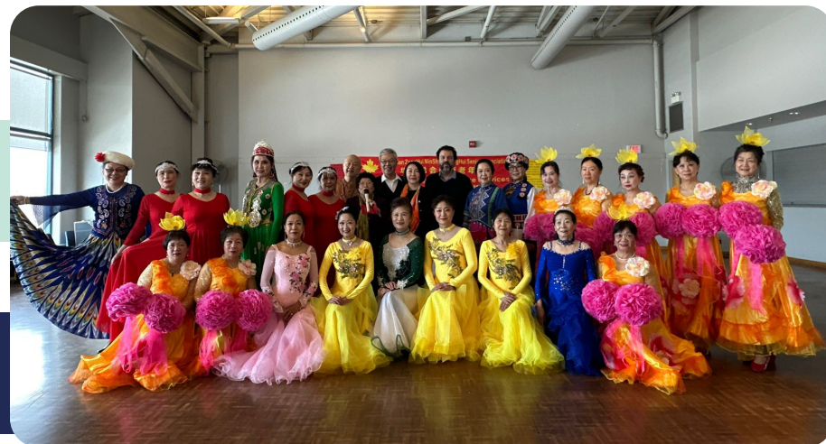
Seniors from Hualian Senior Club & Canada Mandarin Culture Service | 来自华联老年俱乐部和加拿大普通话文化服务的老年人