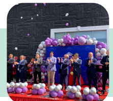
Grand opening of Zion Building Supply | 锡安建材盛大开幕