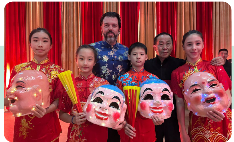
Wushu Kids at the Chinese Cultural Centre of Toronto | 多伦多中华文化中心的武术少年

此外，Wishing Well Dr 与 Pharmacy Ave 的南北连接处最近也安装了减速带，以进一步保障学校周边的安全。市政府工作人员和征集回来的社区建议，都是建议增设多些其他地点。