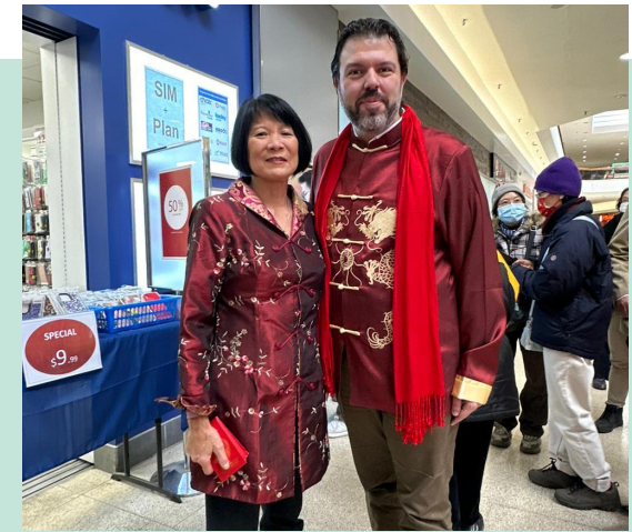
Celebrating Lunar New Year with Mayor Chow at Bridlewood Mall

虽然许可证促进了更高的安全标准，但我仍然致力于维护您作为居民的权利。我的办公室将继续密切监测局势，以透明和有效的方式处理出现的任何问题。您的福祉仍然是我的首要任务。