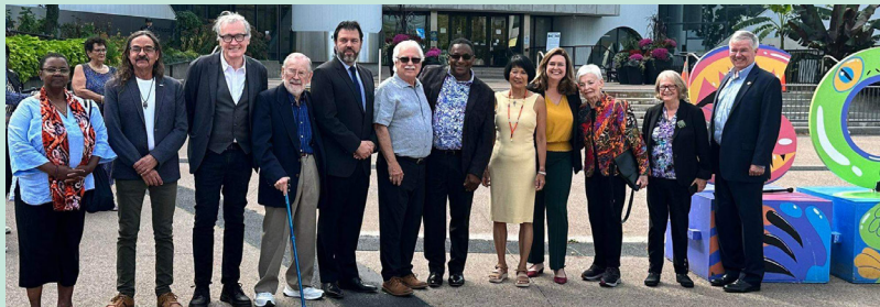
Celebrating the 50th anniversary of the Scarborough Civic Centre

Solid Waste Rebate: For homeowners 65+, 60-64 with specific benefits, 50+ receiving pensions, or with disabilities, with eligible garbage bin sizes (S, M, L) or be a single-family residential bag-only customer. To change the size of your bin please contact 311 Toronto.