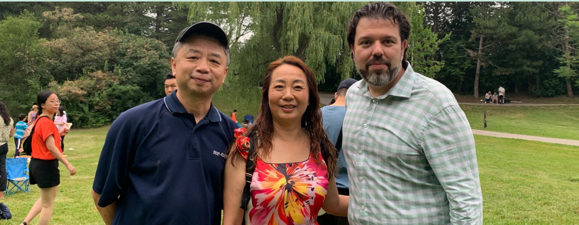
At Ward 22 Community BBQ & Movie night 2023

In our efforts to create a cleaner, greener city, we’re also working hard to enhance environmental initiatives. Keep an eye out for upcoming programs focused on waste reduction, energy efficiency, and environmental education.