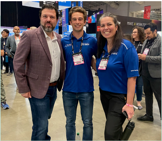
With the Project Arrow team at Collision Ontario's first electric car project

请参加于 2024 年6 月 15 日星期六和7 月 6 日星期六上午 10 点至下午 2 点 在 L’Amoreaux 社区中心(Mary Ward 学校和 L’Amoreaux社区中心之间的停车场) 我们每年举行的年度环境日活动 。每车可获得两袋免费花园堆肥！